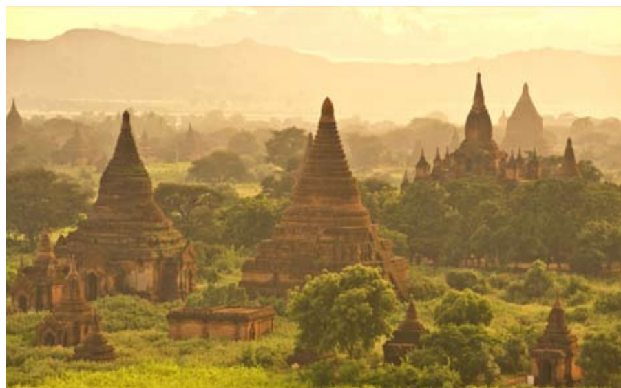
The temples of Bagan.

"The difficulty for photography is that most clients